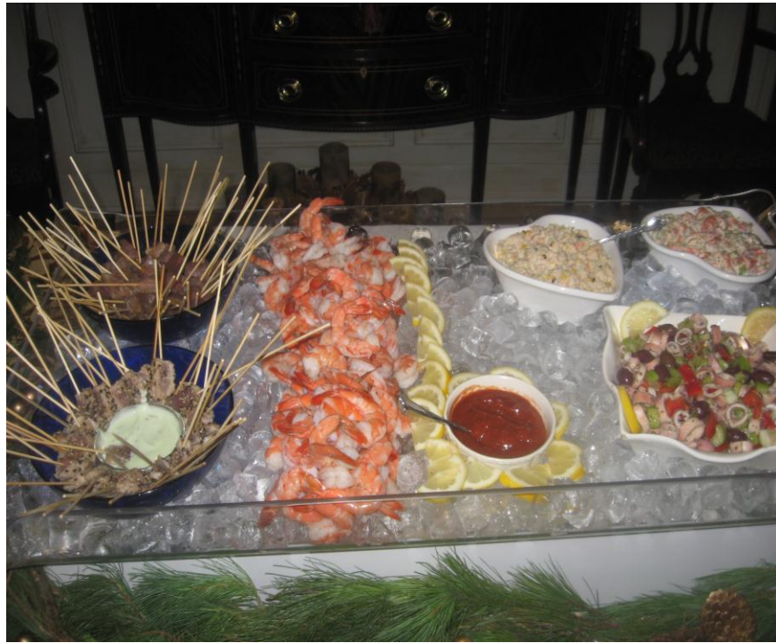
Seafood Sampler (smaller sampling of Ice Glow of Assorted Seafood: Tequila Lime Shrimp, Classical Shrimp Cocktail (16/20's) and Asian Pesto Shrimp ,Black & Blond Sesame Tuna, Tahini Crab Salad, Mini Oyster Crackers, Cusabi Sauce (cucumber/Wasabi cream), Raspberry Cocktail Sauce, Wasabi Cocktail Sauce, Avocado corn relish (terrific with Tequila lime shrimp), Sliced lemons and limes

Vegetarian Table: vegetable antipasto with grilled yellow squash, zucchini, eggplant, yellow & red peppers, Portobello mushrooms, artichoke hearts, shaved Reggiano Parmigiano, Bocancini (proscuitto and pepperoni by request), Vegetarian Quesadillas, Roquefort grapes with walnuts, sun dried tomato cheese tort & double pesto cheese tort, an assortment of crusty baguettes and flatbreads, served with a of balsamic reduction dipping sauce